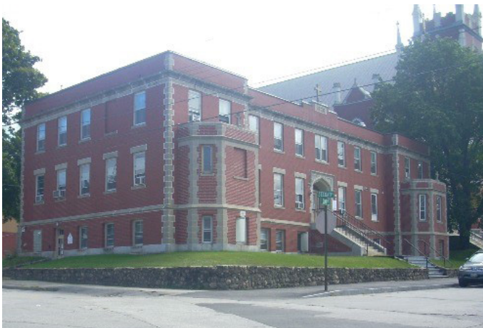
Expansion and renovations are already underway to serve more people on their recovery journey at St. Francis in Auburn.