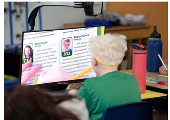
An ESBVIC student uses technology to adapt classroom reading material to her needs.