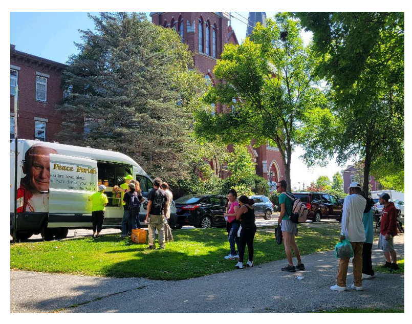
Community members eagerly await care bags from the "Cross the Street" Ministry.

The Matthew 25 grant award will enhance "Cross the Street's" capabilities, equipping their van with an electric food bay container and portable refrigerator/ freezer. This upgrade allows the ministry to provide perishable items, offering hot meals in winter and cold refreshments in summer, while addressing the critical need for evening meals in the community.