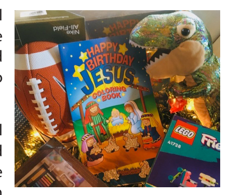
Gifts pile up before finding a happy home!

Gifts are set up in various locations where family case managers, school counselors, and others "shop" for the children. The heartfelt notes received from families express deep gratitude and highlight the profound impact of the Jolly Gifts program. For many, this program means the difference between an empty tree and a Christmas filled with joy.