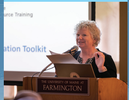
Networking and the latest lake science at the annual Lake Conference