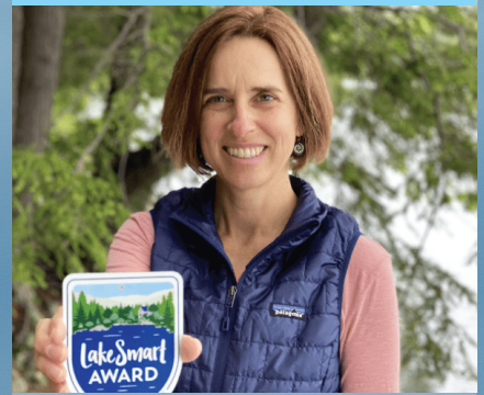
LakeSmart volunteer teams reduce erosion and protect lake health