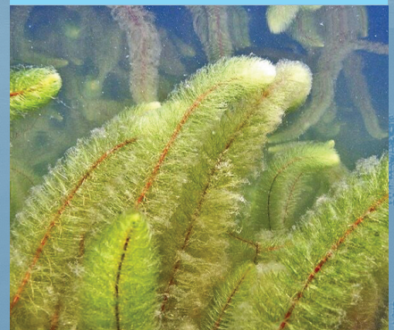
Advocacy protects invasive species funding critical to associations' work