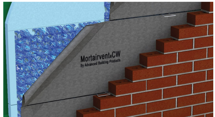
Mortairvent® CW is easily installed by simply rolling the product horizontally between the brick ties.