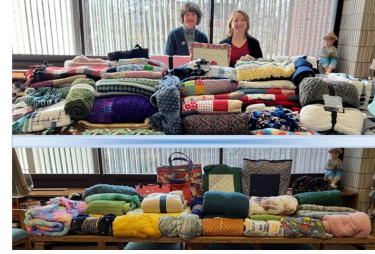
Prior year donations.

blankets to benefit Cornerstone Shelter in Vernon/Rockville and Holy Family Home Shelter in Willimantic. The shelter residents appreciate the skill and time required to create the beautiful handmade quilts and blankets. Drop off your new creations to the library throughout November and December.