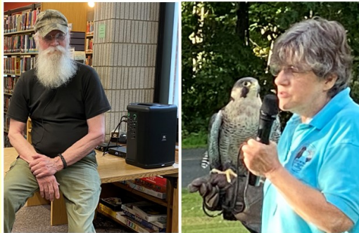
Greater Together Community Fund!