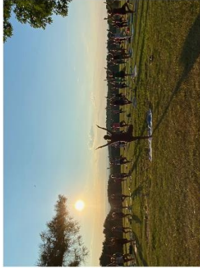
2nd Place ~ "Bolton Land Trust's Yoga at Treat Farm"