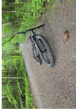
3rd Place ~ "Why did the turtle cross the rail trail?" By Scott Livingston