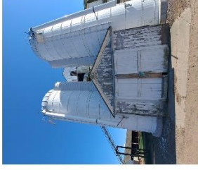
1st Place ~ "The Beauty of Fish Family Farm" By Natassia Brown