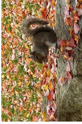
2nd Place ~ "Yummy Acorns" By Avery Conklyn