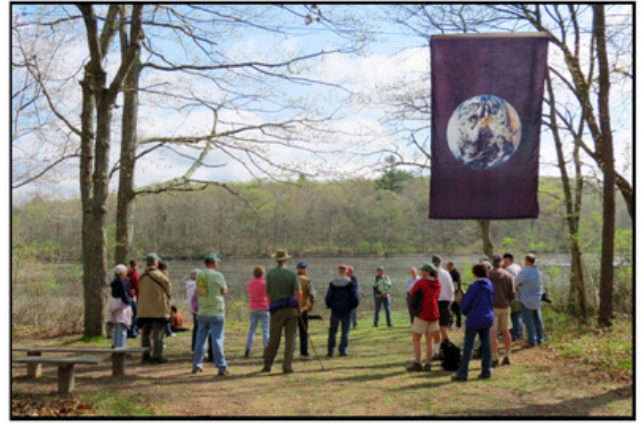
One of many Earth Day Celebrations in the park!

The BCC continues to manage the trails in Freja Park and is looking for trail monitors and volunteers who will report trail conditions to the Conservation Commission as well as helping out with work parties.