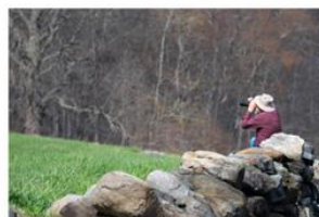
3rd Place - "Shuttered Solitude" Rich Fitch