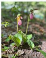
2nd Place - "Pink Beauties" Sylvia Ounpuu