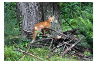
2nd Place - "Fox Hunting Stride" Lindsay Pettinicchi