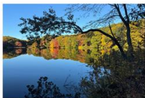
3rd Place - "Fall reflections on Tinker Pond" Lauren Coleman