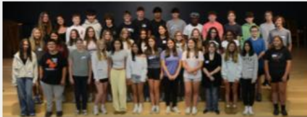
Class of 2026 Celebrating Sunrise Together