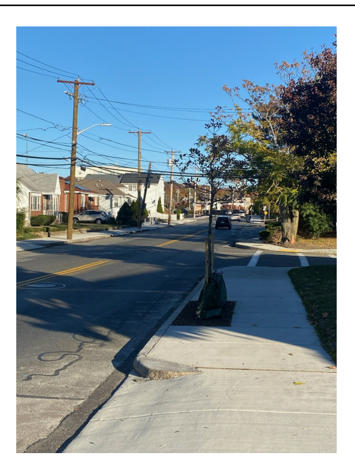
Washington Avenue Sidewalk Project Completed

playground until its official reopening.