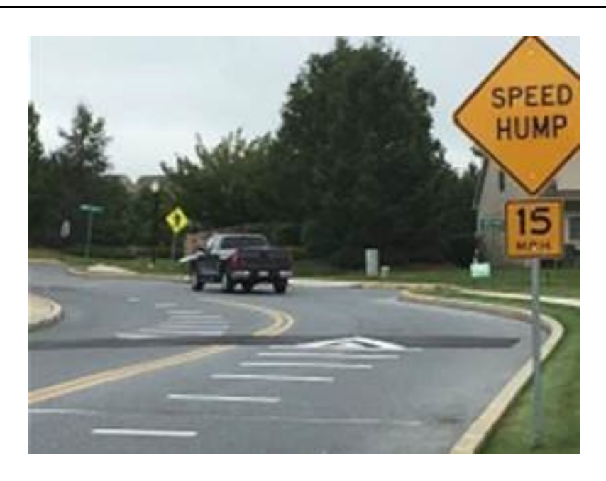
Traffic Calming Approval Process Approved by Traffic Commission

You can learn more about the project on the project website .