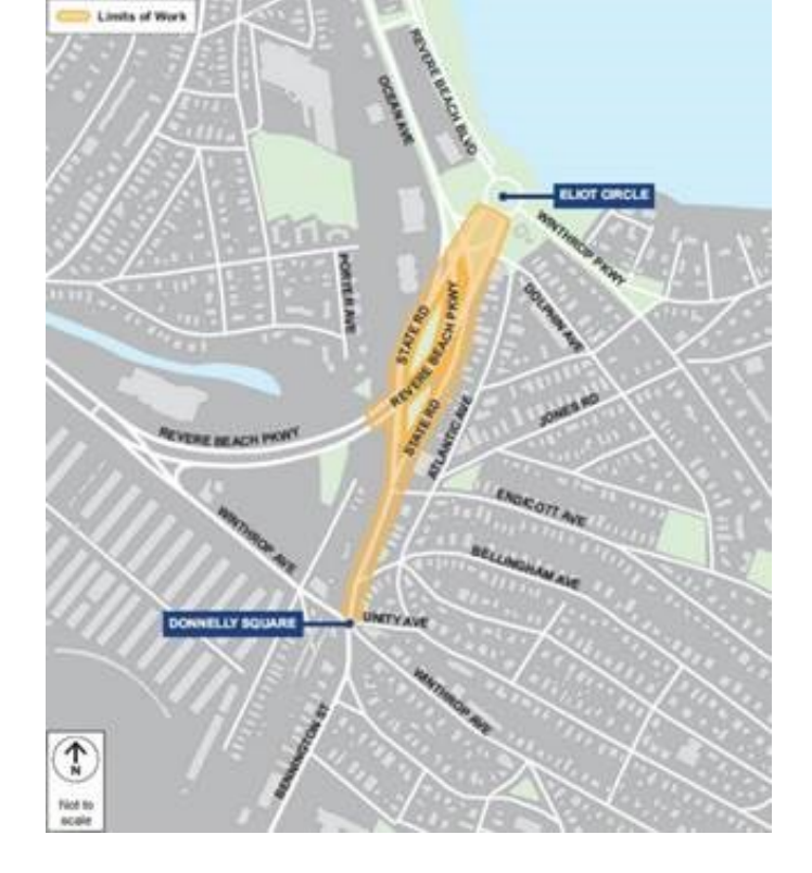
Design Public Hearing Held for the Beachmont Connector

On October 15th, a Design Public Hearing took place concerning the Beachmont Connector, an important <a href="MassDOT">MassDOT</a> initiative with a budget exceeding $7 million. The focus of the <a href="mailto:meeting">meeting</a> was to present and discuss the 25% project designs, as well as to outline the next steps in the planning process. This project is designed to connect Beachmont Square with Eliot Circle and Revere Beach. The design will advance towards 100% completion over the next few years, with a targeted start for construction set for Spring 2027.