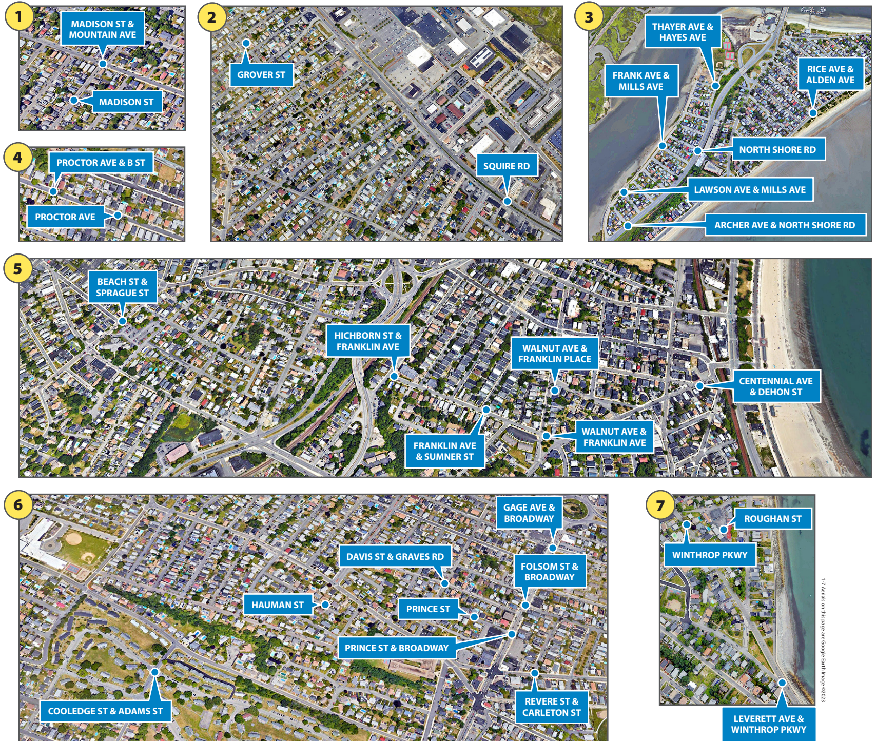
1-7: Aerials on this page are Google Earth Image ©2023