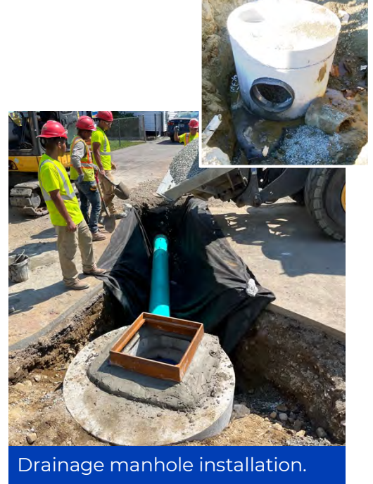
Drainage manhole installation.

This project includes, but is not necessarily limited to the installation of approximately 1,450 LF of 12"-15" HDPE drain pipe, 17 drain manholes, and 14 catch basins.