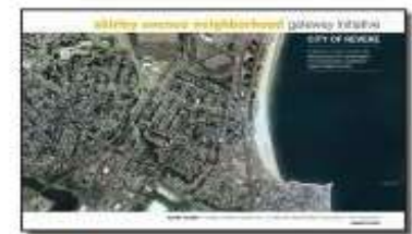
2009 Shirley Avenue Neighborhood Gateway Initiative