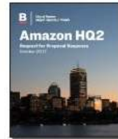
2017 Boston Amazon HQ2 Proposal