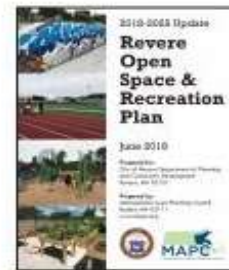
2018 Revere Open Space & Recreation Plan