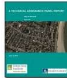
2016 Revere Technical Assistance Panel Report