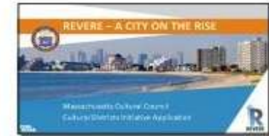
2013 Cultural Districts Initiative Application