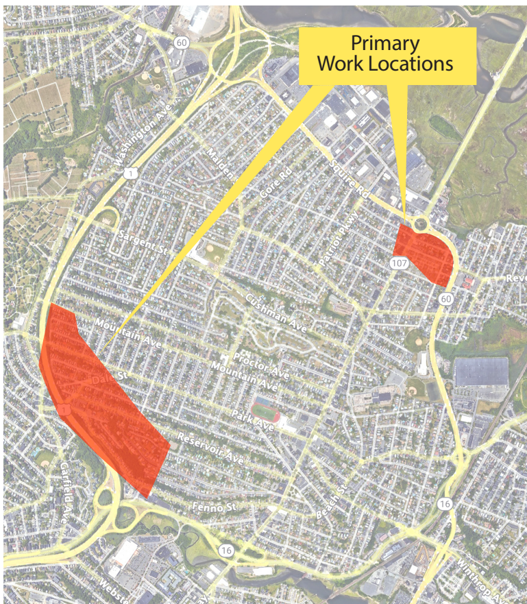
Map data Google©2023