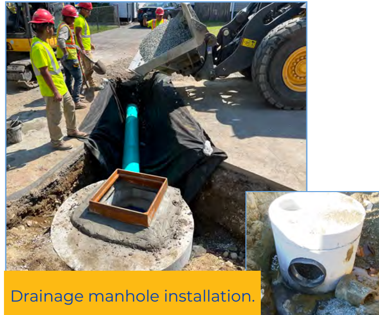
Drainage manhole installation.

This project includes, but is not necessarily limited to the installation of approximately 750 LF of 12"-24" PVC and ductile iron drain pipe, 11 drain manholes, 3 catch basins.