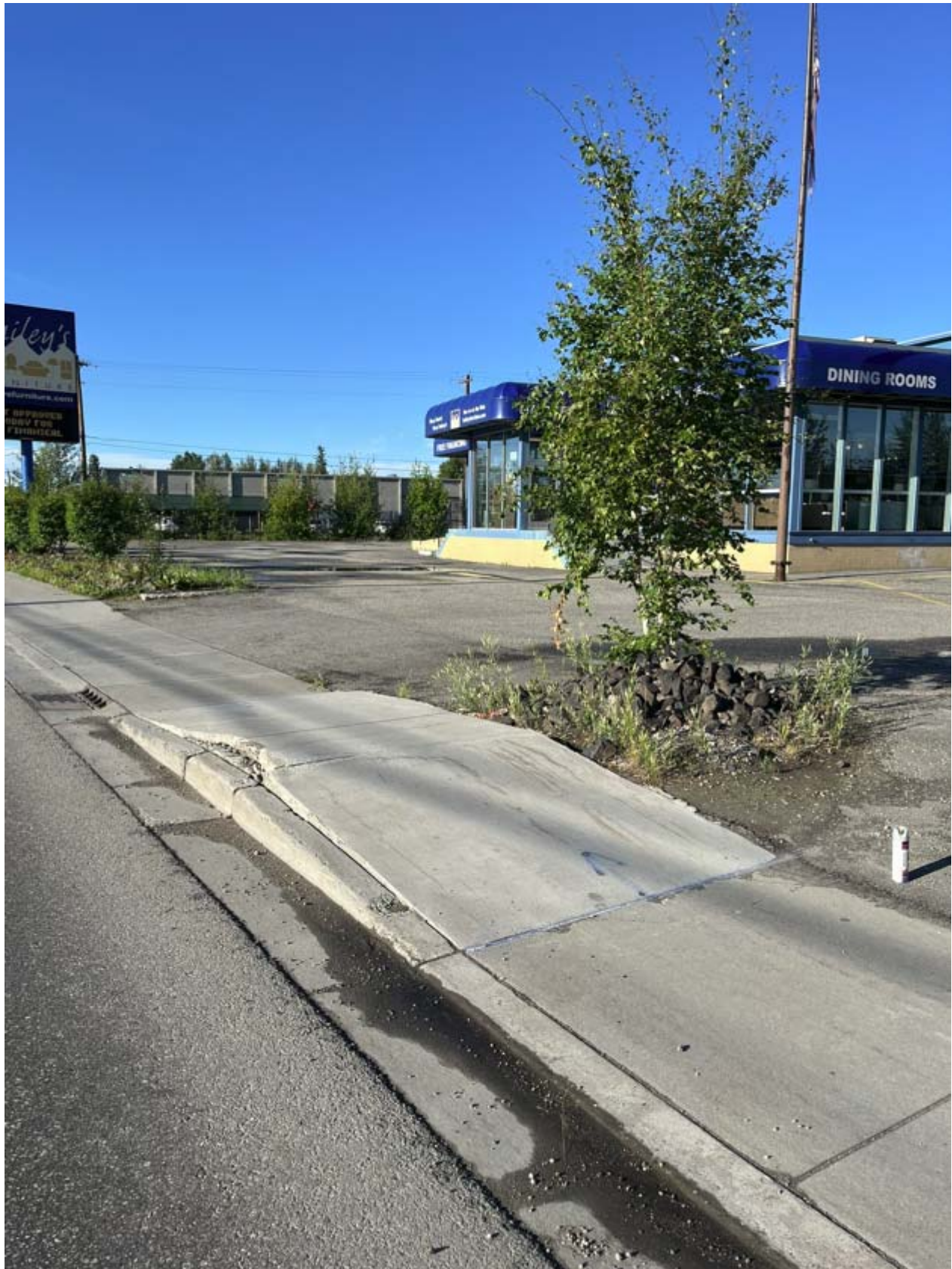
Figure 3: South Cushman Sidewalk Repair Near Bailey's Furniture