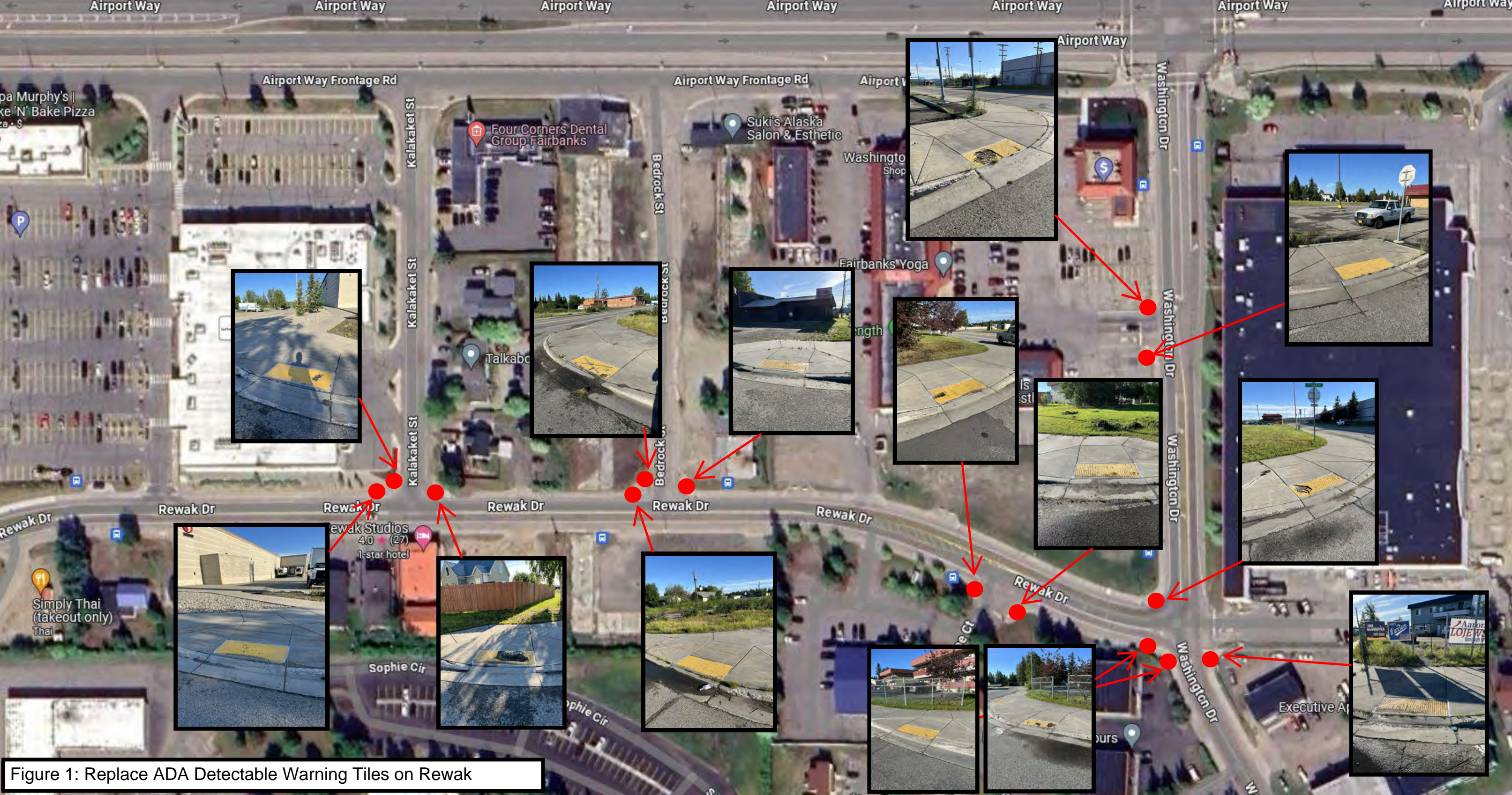
Figure 1: Replace ADA Detectable Warning Tiles on Rewak