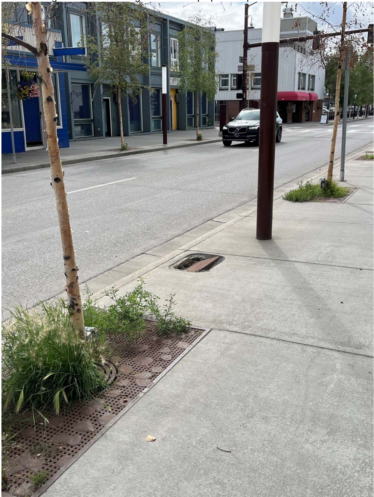
Figure 10: Junction box sidewalk repair on Cushman Street between 2nd and 3rd Avenue