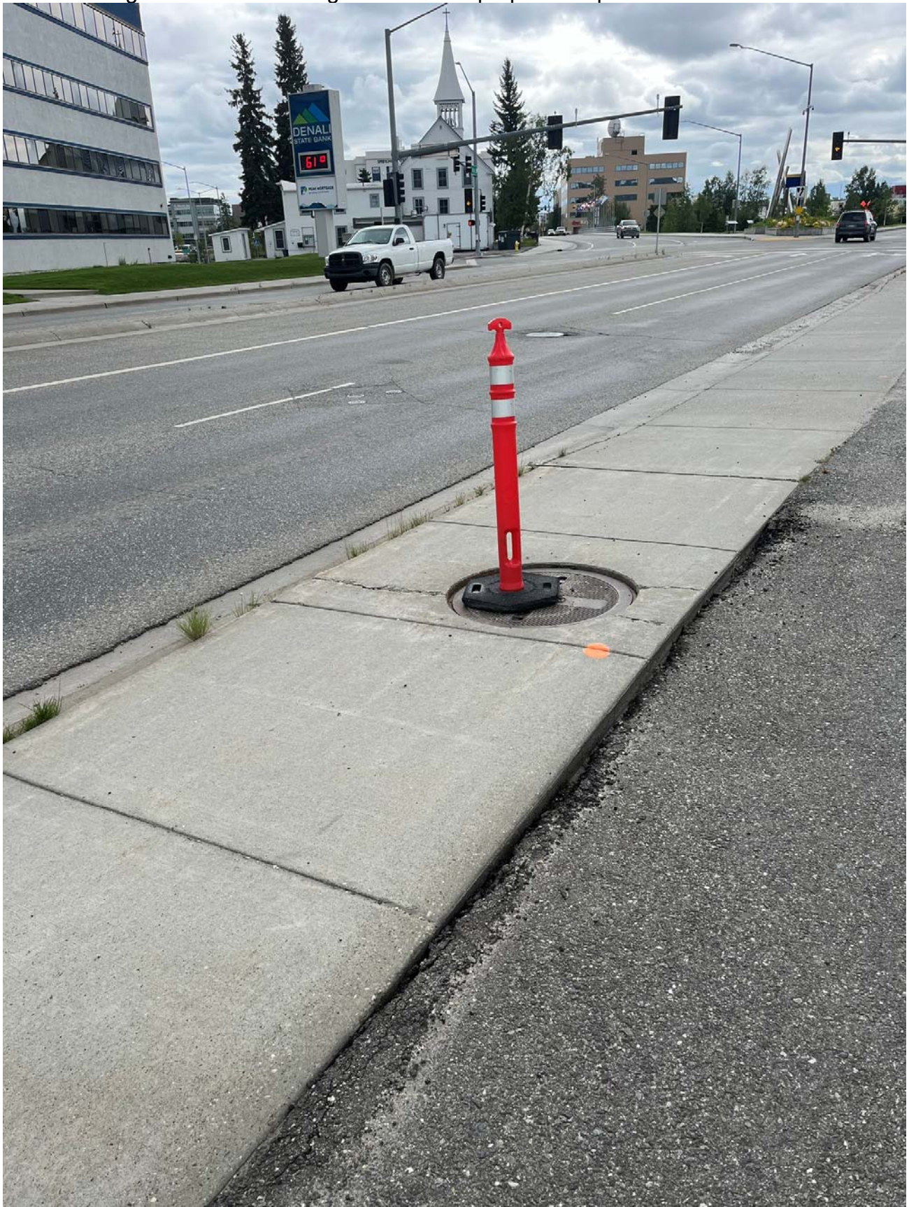
Figure 9: Illinois Sidewalk Repair Near Fairbanks Daily News Miner