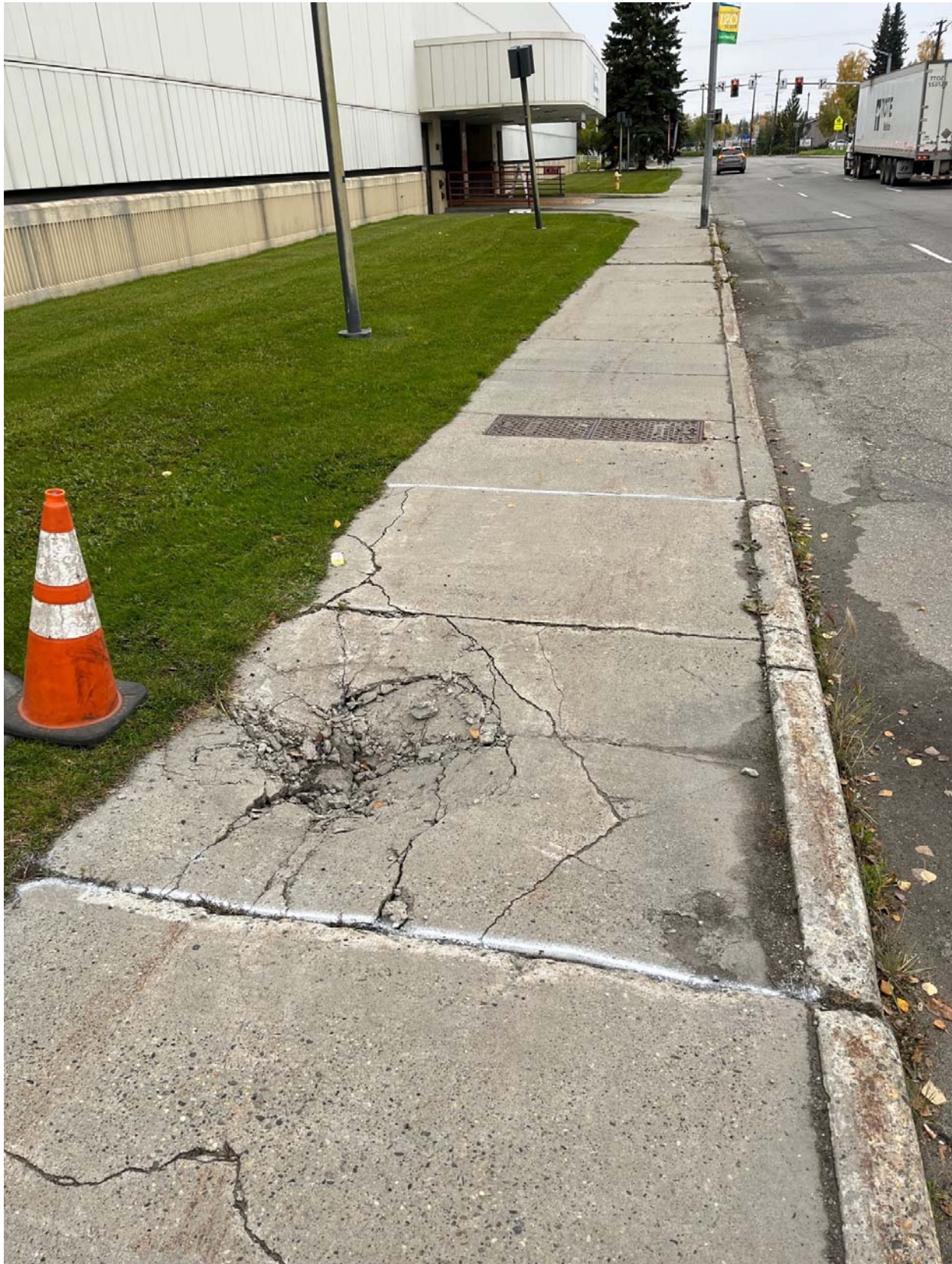
Figure 5: Barnette Sidewalk Repair Near UAF Downtown Parking Garage