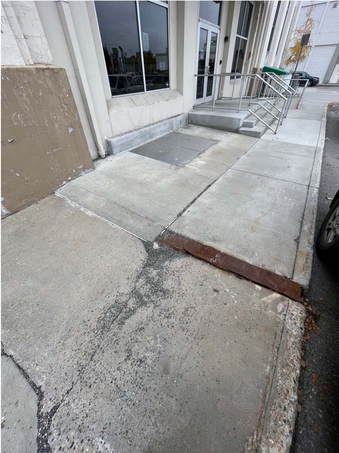
Figure 6: Trench Drain Repair on Turner St