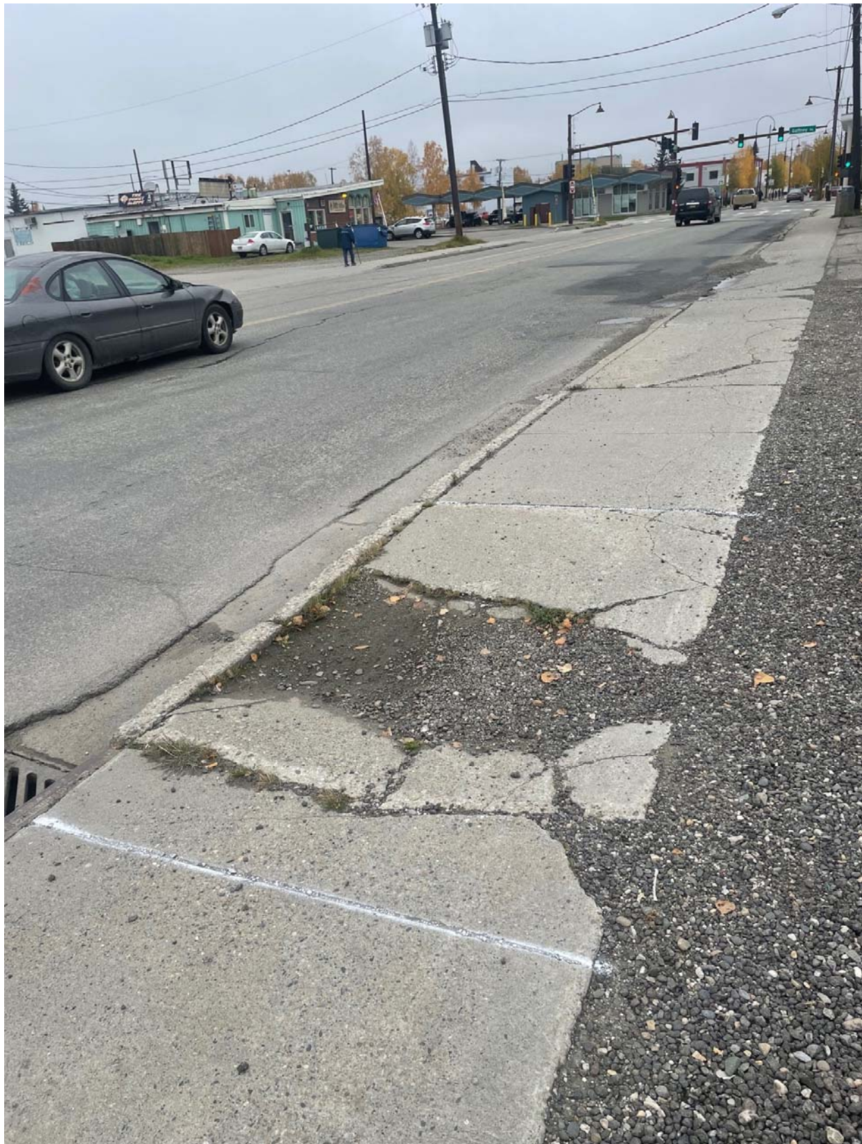
Figure 4: Cushman Sidewalk Repair Near the Spur