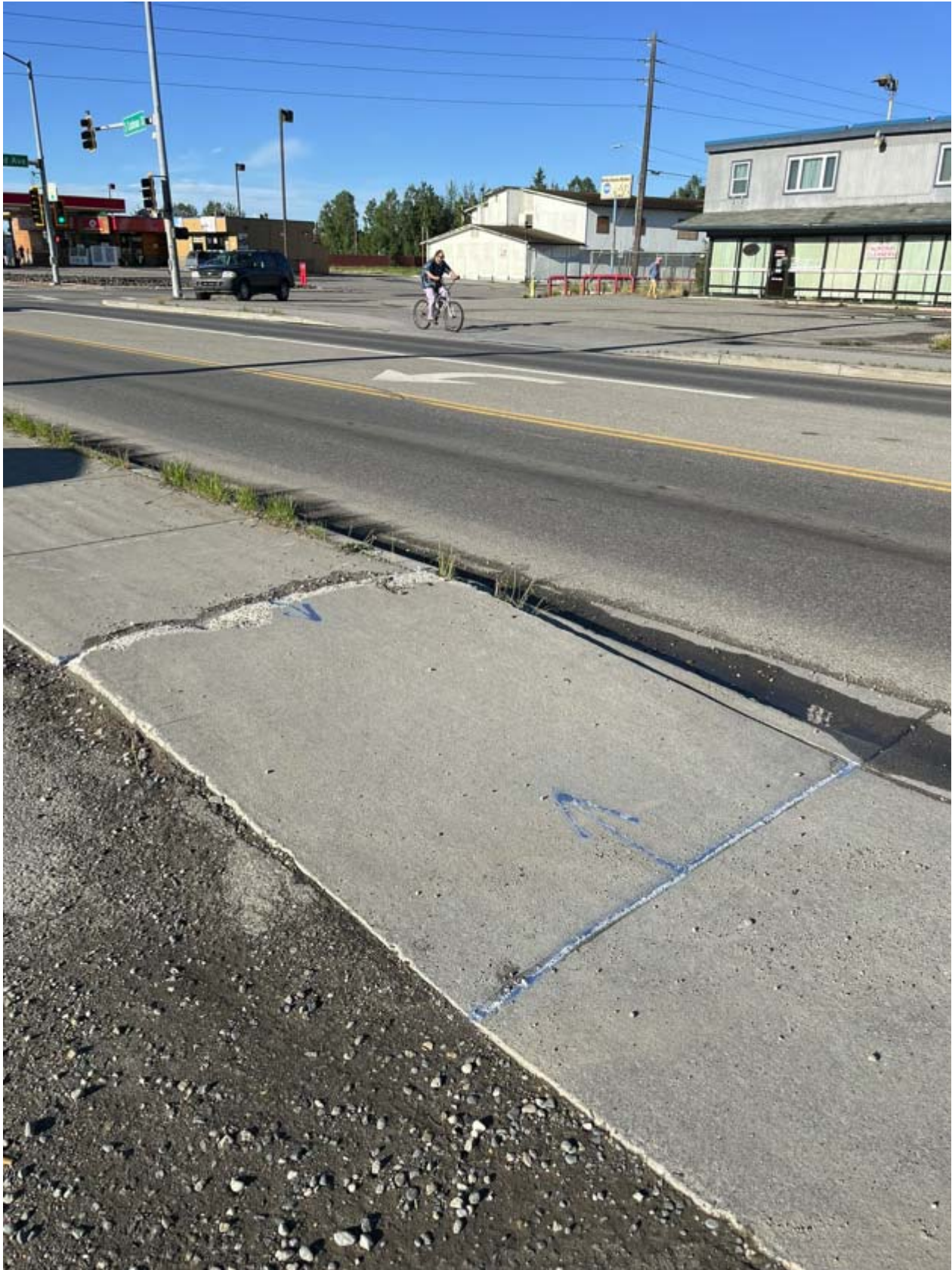
Figure 2: South Cushman Sidewalk Repair Near the C&J's Diner