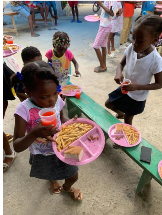
Haitian children enjoying their meal together.