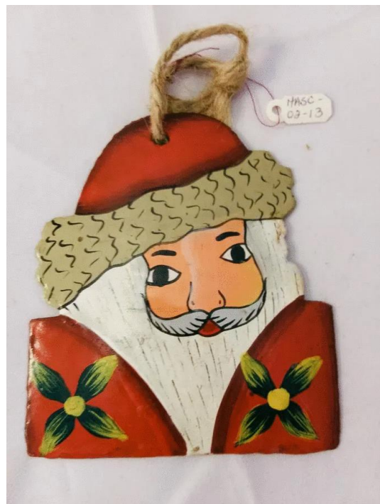
Nicaragua Corn Husk Angel Ornament, Haiti Christmas Decoupage Cards, Mexico Talavera Hanging Angel Holder, Haiti Metal Christmas Stocking Ornament, Haiti Metal Santa Ornament.