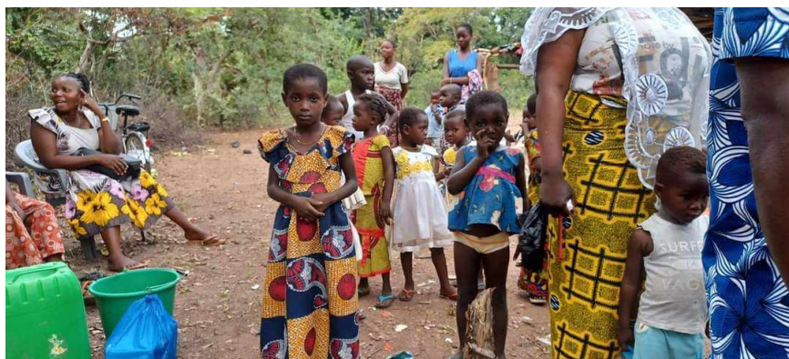
Families waiting in line in Cote d'Ivoire - our newest HHSM partnership.