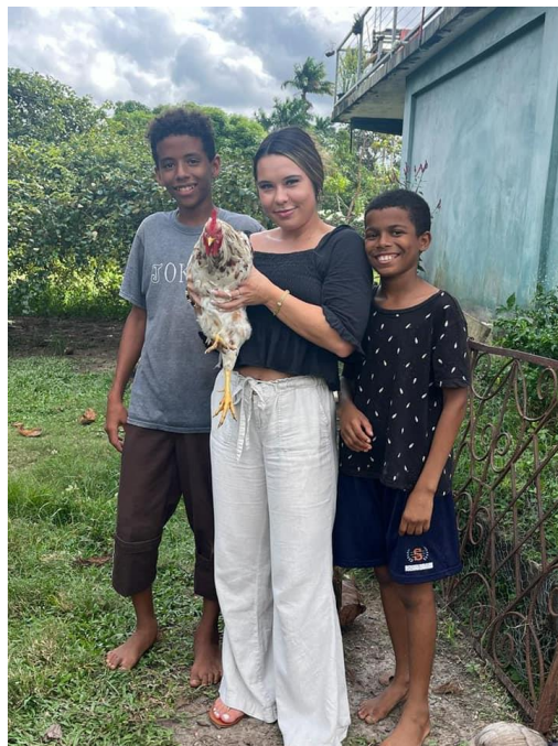
A new team member holds a family rooster during an update visit outside Belize City.