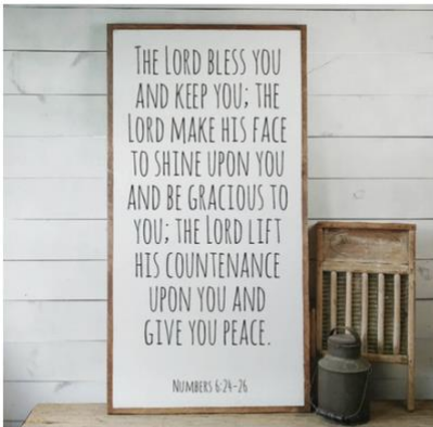
Thank you and blessings to our sponsors and donors.

spent the first week by ourselves, so we could catch up with the pastors and find out how things were going in the sponsorship program.