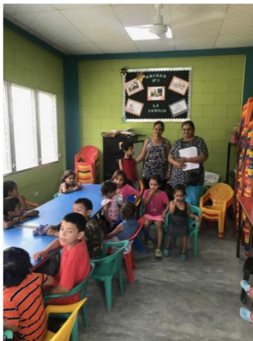
The children in Zolano are waiting for their food in the new classroom.

Some good news from Zolano is that a new two-story church was built this past year, thanks to some generous donors. The classrooms are on the 1 st floor and are being used for the children's spiritual and physical growth. The children attend Bible School either in the afternoon or morning, depending on when they are in public school. The church is on the 2 nd floor and is beautiful.