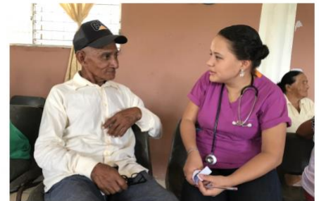
A doctor is talking with a senior in Nueva Florida to find out what his need are.