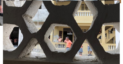
Trou du Nord