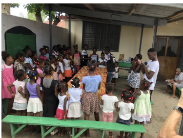
Saturday Feeding Program