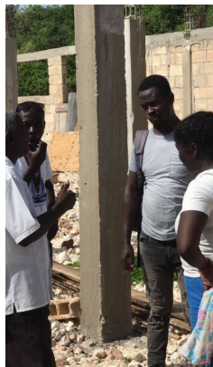
Old and new friends talking about the events that had taken recently taken place.