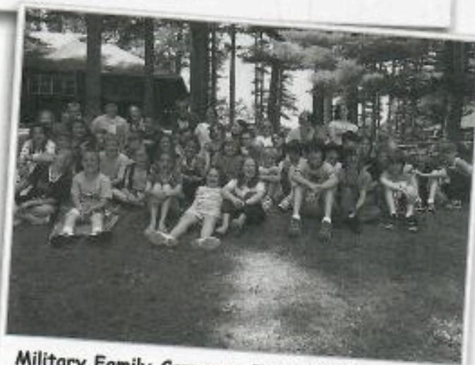
Military Family Campers: "Hoo YAI"