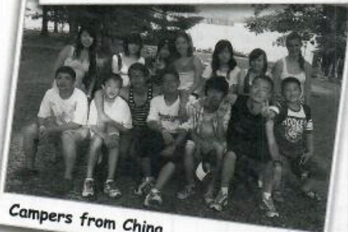
Campers from China