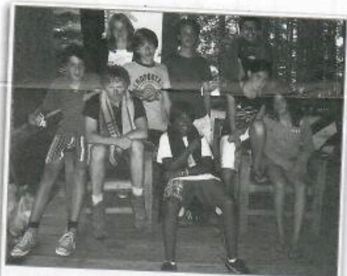
Campers from France