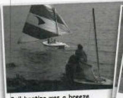
Sail boating was a breeze

Individuals who have questions or need additional information can e-mail the camp at: info@maineycamp.org