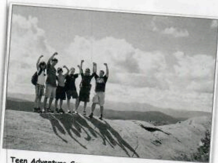
Teen Adventure Campers at the "Top of the World"

Hope to see you this summer, "Where It's Always 72 Degrees & Sunny!"