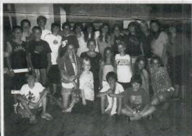
Campers from Canada