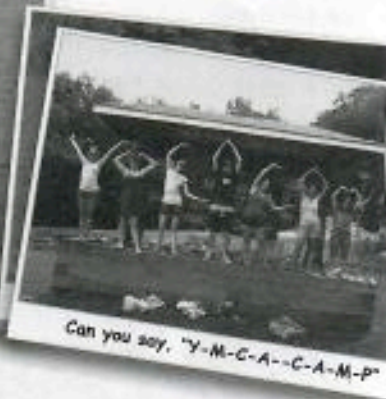
Can you say, "Y-M-C-A--C-A-M-P"