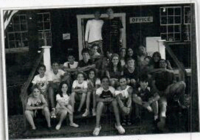
Campers from Spain and Mexico

There is also more excitement to talk about as the State YMCA Board of Directors has entered into the second year of the capital campaign for renovating all of our camp facilities. The campaign is called the "Director's Campaign." The campaign is under the direction of a Capital Steering Committee made up of Board Members, Alumni and Volunteers. Every dollar raised so far has gone to benefit the YMCA Camp.