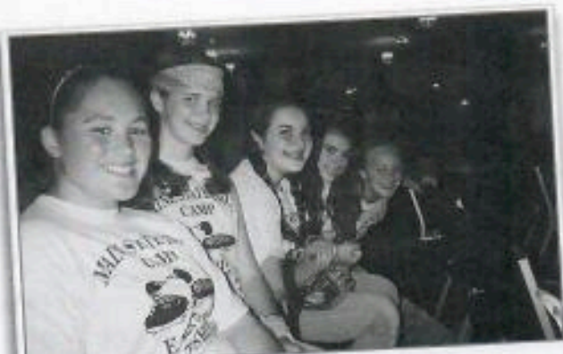
Our "Spelling Bee" Team!