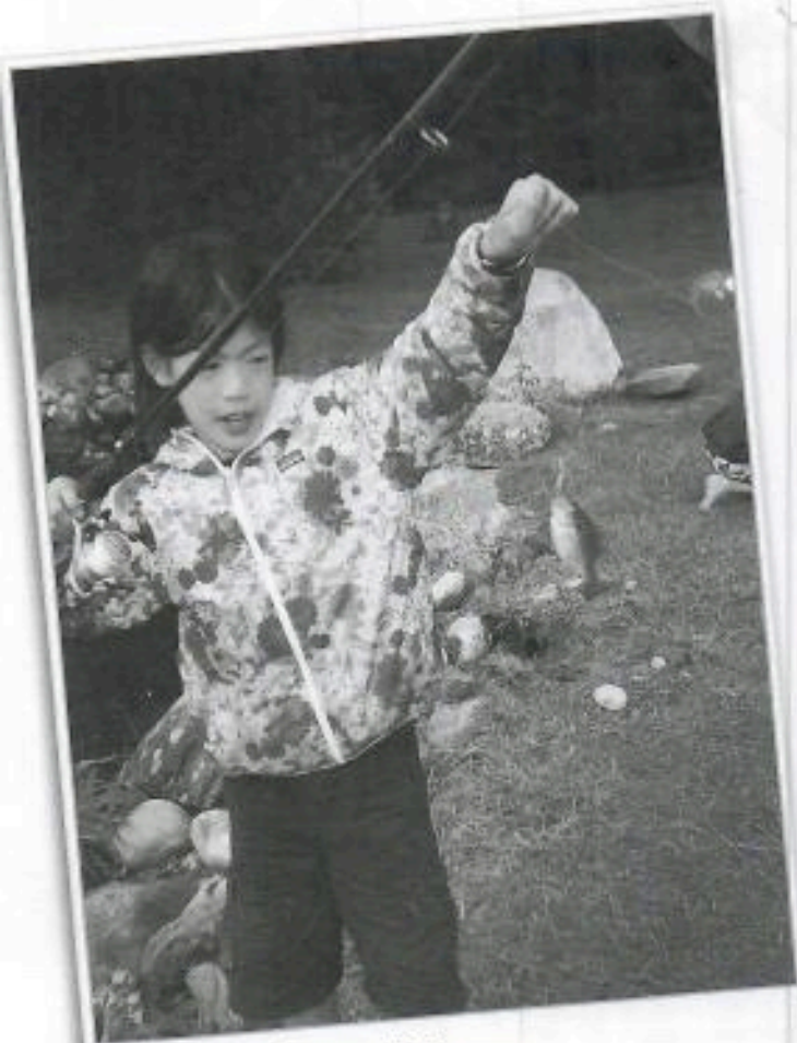
To small for supper

For the most current news and information please visit: www.maineypcamp.org