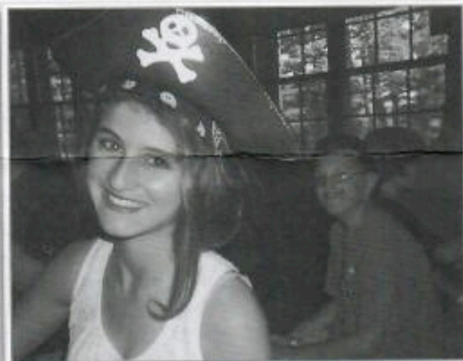
ARRrrrrrrr matey... (pirate weekend)

The Y camp is always appreciative and willing to accept donations for our scholarship program. Campers who need support should contact the YMCA Camp office for a scholarship application. You can contact the office by e-mail or call direct at (207) 395-4200.