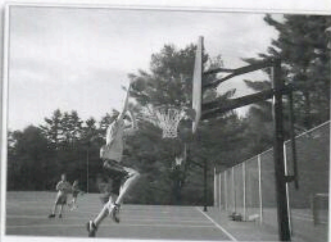
Oh snap! M.J. is back!