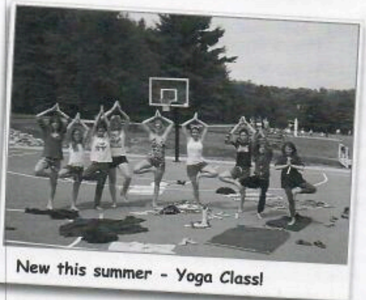
New this summer - Yoga Class!

Hope to see you this summer, "Where It's Always 72 Degrees & Sunny!"