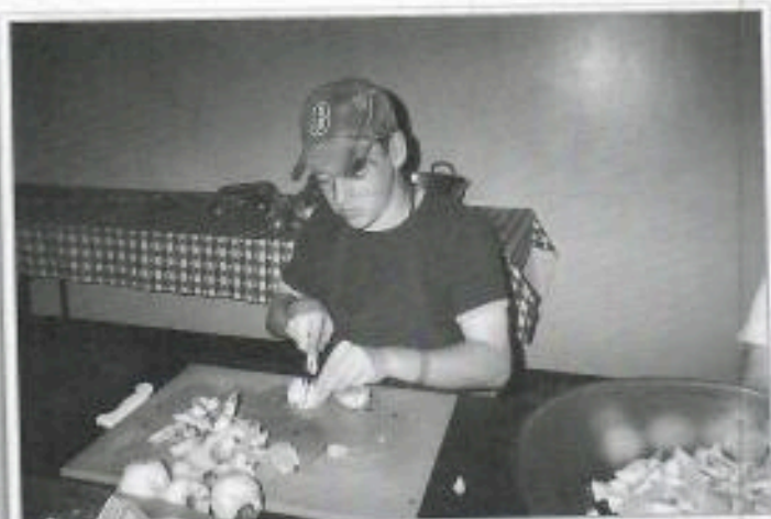
LIT volunteers at soup kitchen