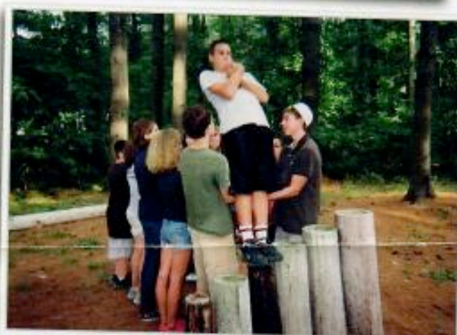
Trust building for Leaders in Training