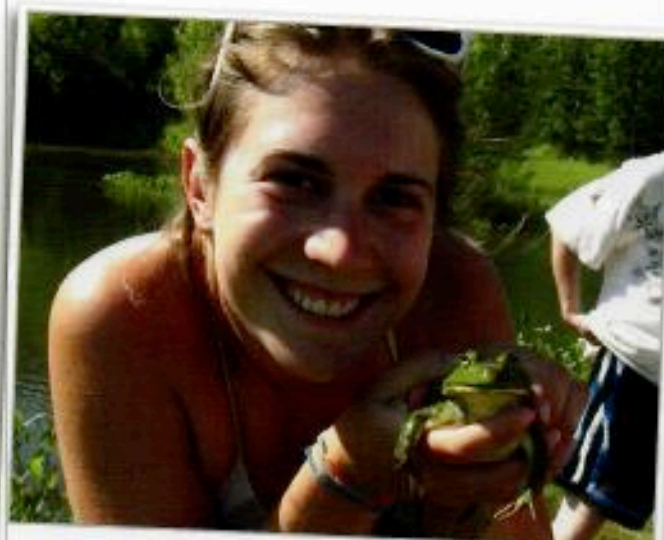
Hey, is that Prince Charming?

The Y camp is always appreciative and willing to accept donations for our scholarship program. Campers who need support should contact the YMCA Camp office for a scholarship application. You can contact the office by e-mail or call direct at (207) 395-4200.