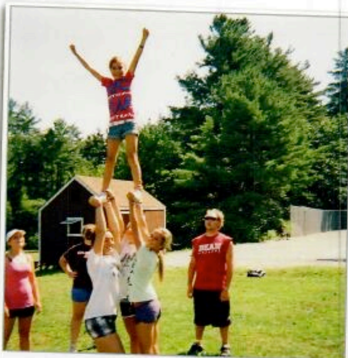
Gimme a "Y"!