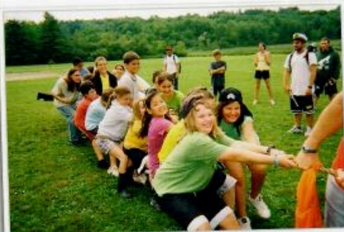
Good ol' fashion tug-of-war

Congratulations to all the nominees and also to the Campers of the Year! We look forward to their return in 2011.