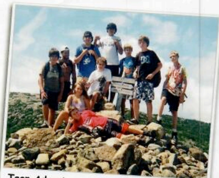
Teen Adventure Camp program