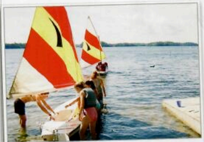
Sailing class enjoying the breeze

Hope to see you this summer, "Where It's Always 72 Degrees & Sunny!"