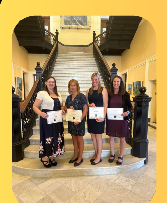
CCHS Community School Coordinators Recognition at the Hall of Flags at the State House