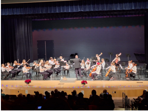
THE HOLIDAY CONCERT WAS A MARVELOUS PERFORMANCE