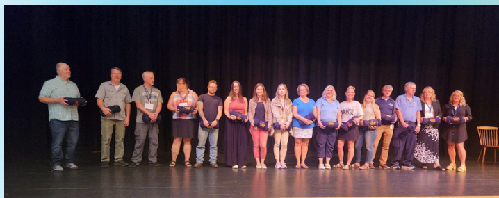
10 year Longevity Award Recipients