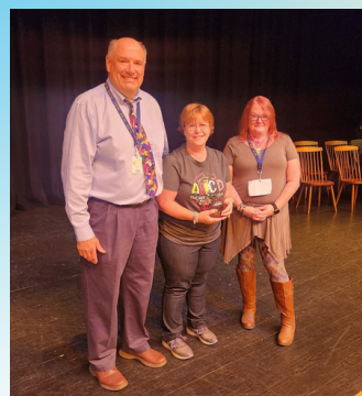
35 Year Longevity Award Recipient