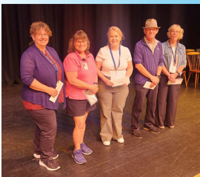
25 Year Longevity Award Recipients