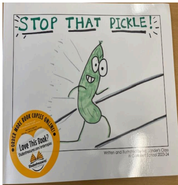
Published 1st Grade Book Logo