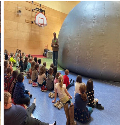
The Traveling Planetarium