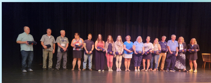
10 year Longevity Award Recipients