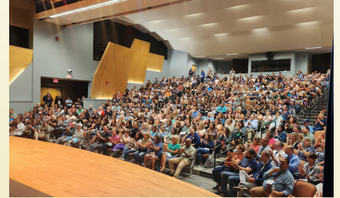
All Staff ~ Opening Day Assembly