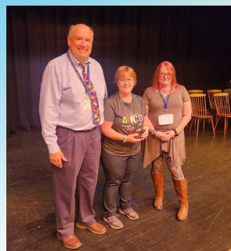
35 Year Longevity Award Recipient