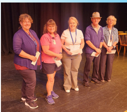
25 Year Longevity Award Recipients