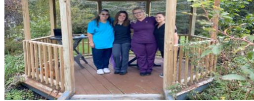
Sandy River Nursing Home CNA Graduates

42 Academic students enrolled 6 Students Completed Workforce Training 102 Enrichment Enrollment 38 Free Community Class Enrollment 23 College and Career Students 5 HiSET Graduates 2 Credit Recovery Students completed their credits