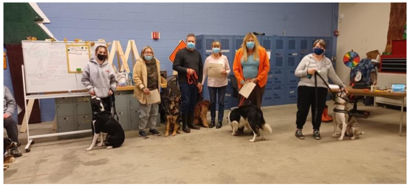
All Four On The Floor 2021

We are also looking at running a CNA-MED class this spring. CNA's who have worked at least a year full-time in the profession can take the 120-hour course to increase their skill level and pay.