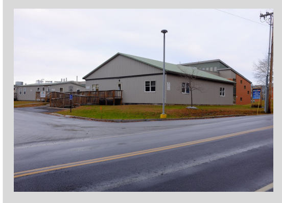
New Adult Ed Learning Center