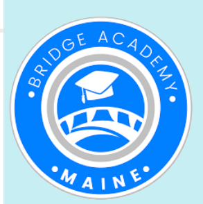
Bridge Academy Students completed year with 196 college credits