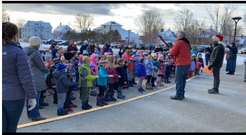
Practicing in front of the school