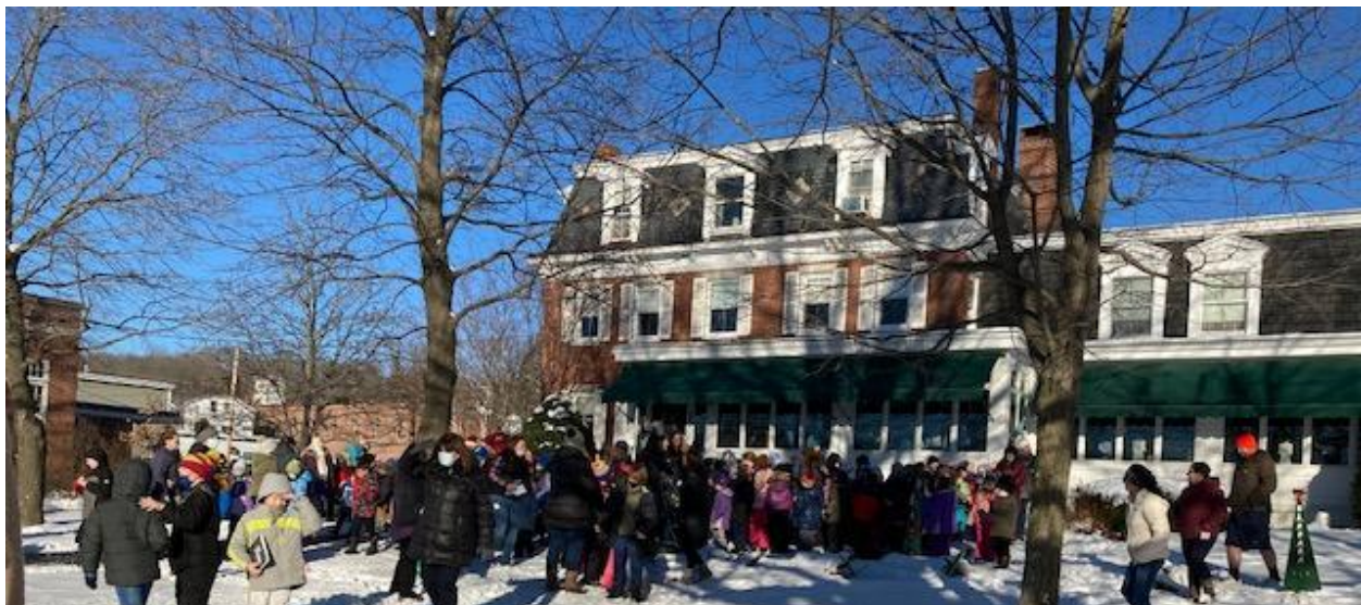
Getting ready to sing at the Pierce House